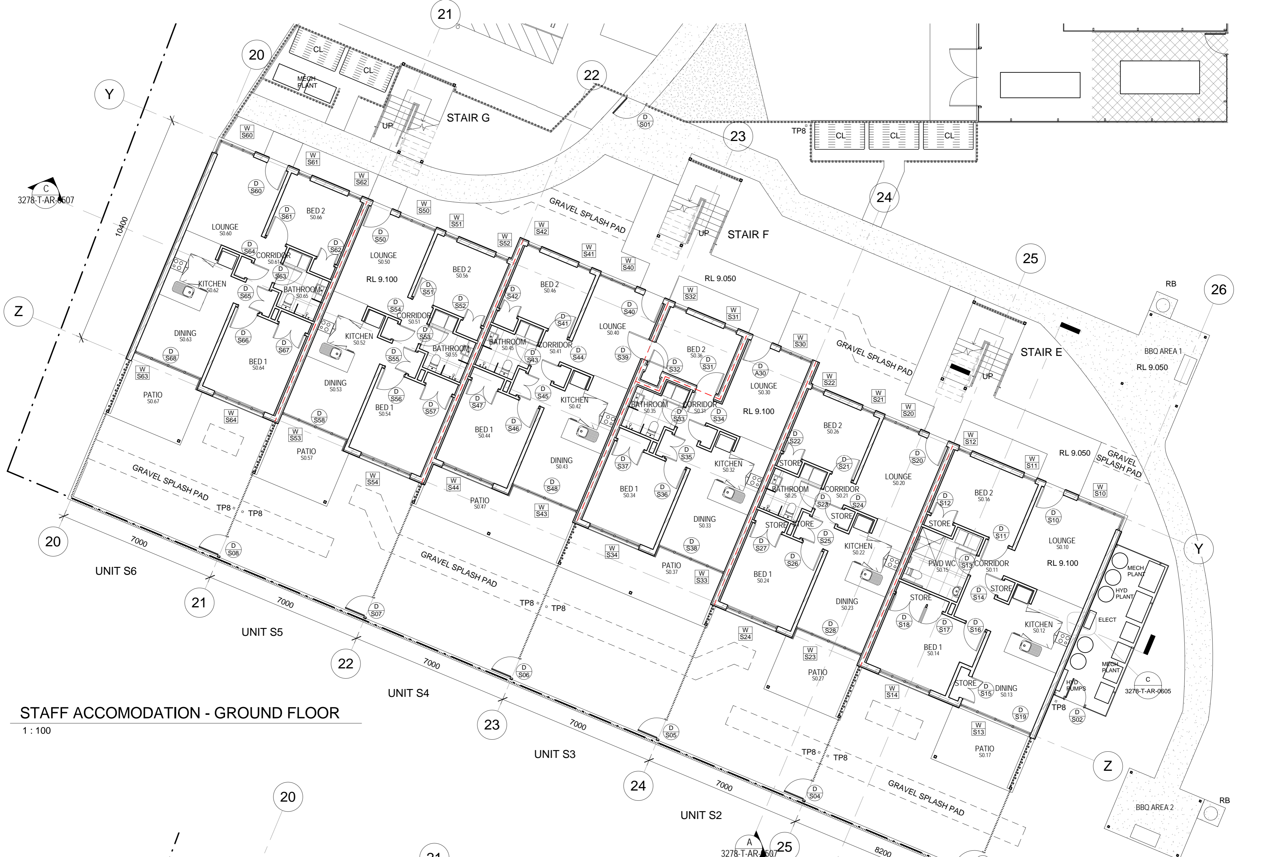
STAFF ACCOMODATION - GROUND FLOOR 1 : 100